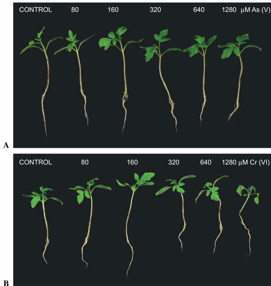
Figure 2. Images of hydroponically cultivated tomato plants treated for 24 h in nutrient solutions supplemented with As(V) (A) or Cr(VI) (B) in concentration ranging from 0 to 1280 \mu\text{M} . Tomato plants were not affected by As(V) treatment. High concentrations of Cr(VI) induced stunting. Arrows point the brownish and necrotic shoot leading to plant bending.

response on tomato plants submitted hydroponically to unnatural concentrations of Cr and As. The non-metallophyte tomato plants behaved as a Cr-sensitive and As-tolerant since the threshold of metal phytotoxicity could be reached with Cr but not with As in the range of metal concentration used.